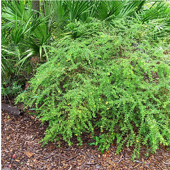
Photo by Ginny Stibolt. Photograph belongs to the photographer who allows use for FNPS purposes only. Please contact the photographer for all other uses.