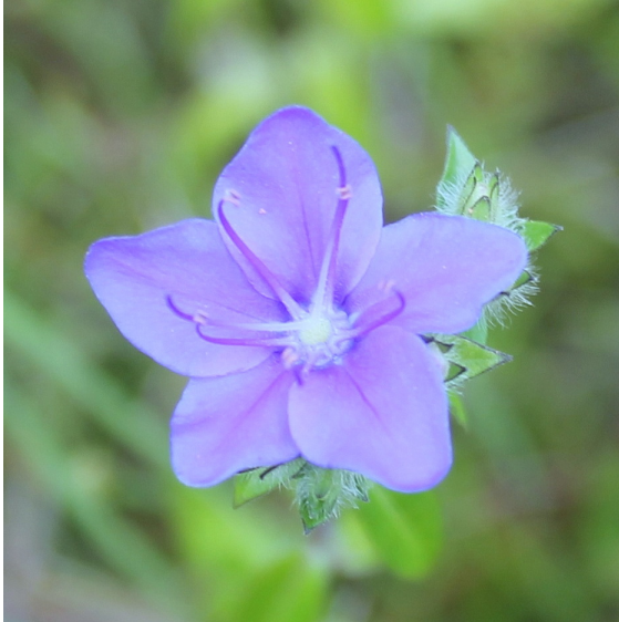
Photo by Jeannie Brodhead. Photograph belongs to the photographer who allows use for FNPS purposes only. Please contact the photographer for all other uses.