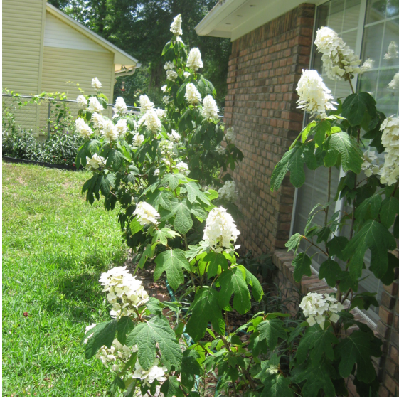
Photo by Ginny Stibolt. Photograph belongs to the photographer who allows use for FNPS purposes only. Please contact the photographer for all other uses.