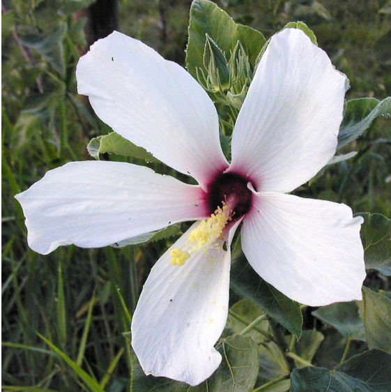
Photo by Shirley Denton. Photograph belongs to the photographer who allows use for FNPS purposes only. Please contact the photographer for all other uses.