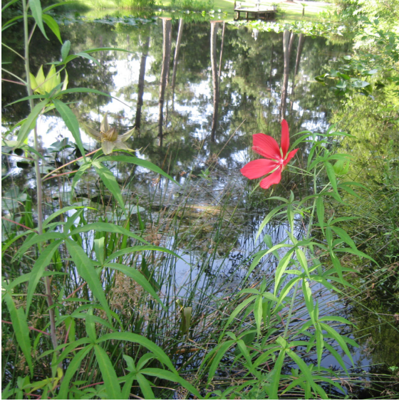
Photo by Ginny Stibolt. Photograph belongs to the photographer who allows use for FNPS purposes only. Please contact the photographer for all other uses.