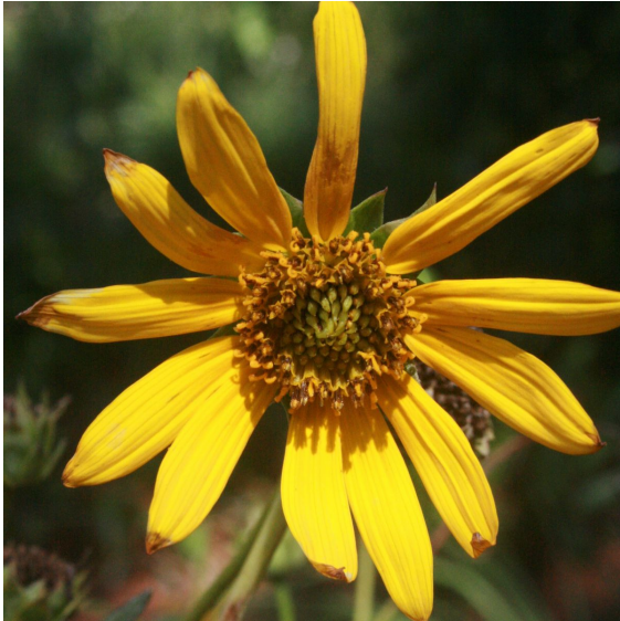
Photo by Craig Huegel. Photograph belongs to the photographer who allows use for FNPS purposes only. Please contact the photographer for all other uses.