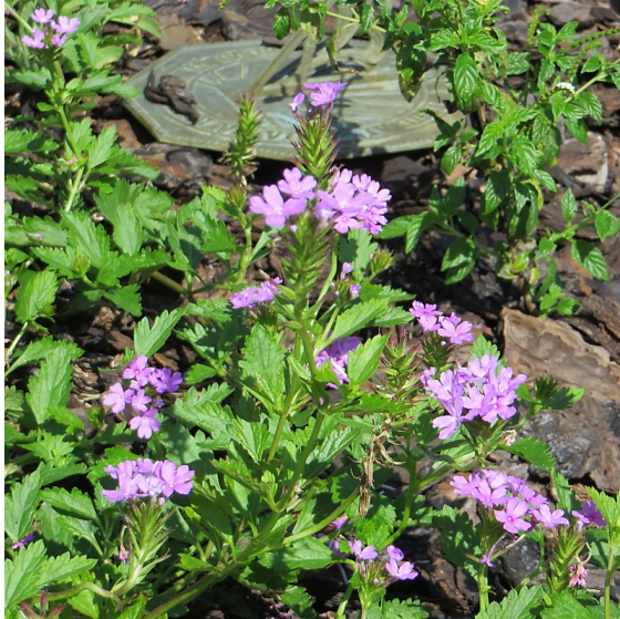
Photo by Mary Ellen Gotto. Photograph belongs to the photographer who allows use for FNPS purposes only. Please contact the photographer for all other uses.