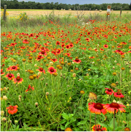
Photo by Ginny Stibolt. Photograph belongs to the photographer who allows use for FNPS purposes only. Please contact the photographer for all other uses.