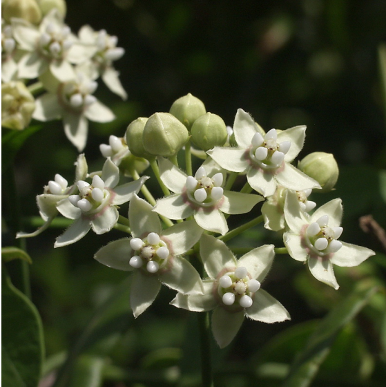
Photo by Shirley Denton. Photograph belongs to the photographer who allows use for FNPS purposes only. Please contact the photographer for all other uses.