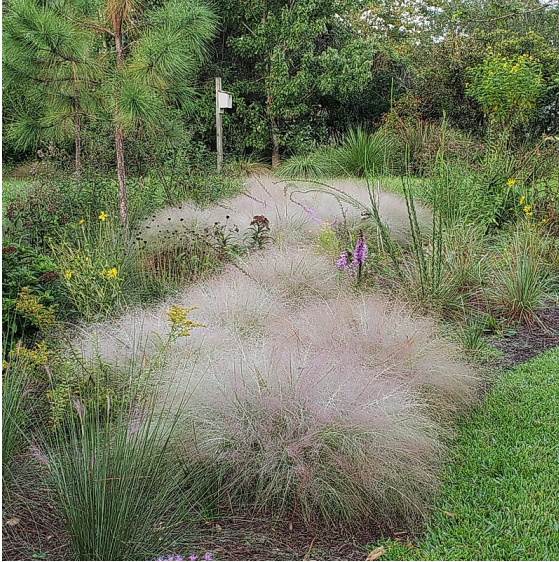
Photo by Janet Bowers. Photograph belongs to the photographer who allows use for FNPS purposes only. Please contact the photographer for all other uses.