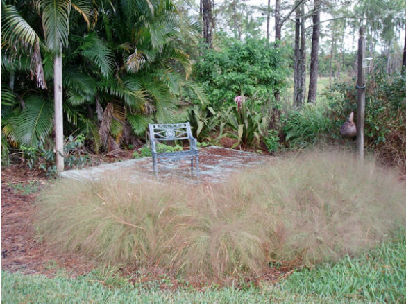
Photo by Ginny Stibolt. Photograph belongs to the photographer who allows use for FNPS purposes only. Please contact the photographer for all other uses.