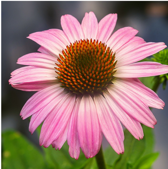
Photo by Roger Hammer. Photograph belongs to the photographer who allows use for FNPS purposes only. Please contact the photographer for all other uses.