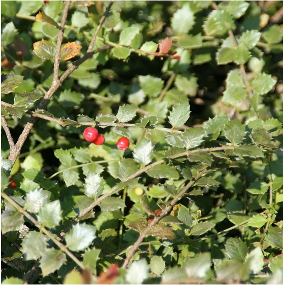
Photo by David J. Stang, from Wikipedia Commons. Photograph belongs to the photographer who allows use for FNPS purposes only. Please contact the photographer for all other uses.