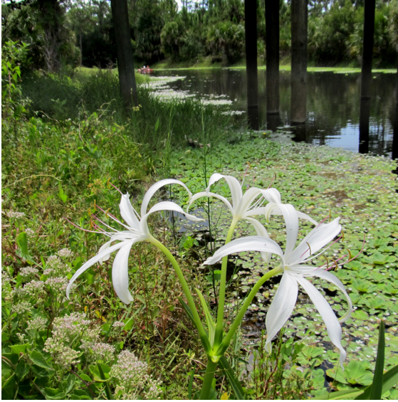
Photo by Ginny Stibolt. Photograph belongs to the photographer who allows use for FNPS purposes only. Please contact the photographer for all other uses.