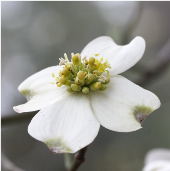
Photo by Shirley Denton. Photograph belongs to the photographer who allows use for FNPS purposes only. Please contact the photographer for all other uses.