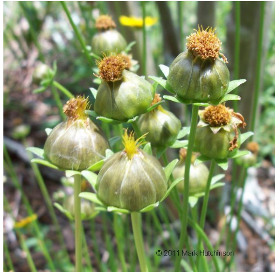
Photo by Mark Hutchinson. Photograph belongs to the photographer who allows use for FNPS purposes only. Please contact the photographer for all other uses.