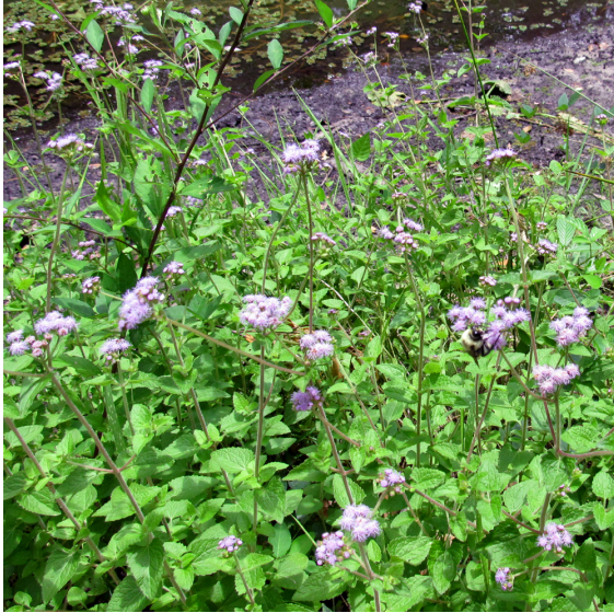
Photo by Ginny Stibolt. Photograph belongs to the photographer who allows use for FNPS purposes only. Please contact the photographer for all other uses.