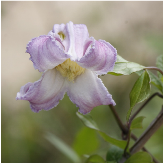
Photo by Shirley Denton. Photograph belongs to the photographer who allows use for FNPS purposes only. Please contact the photographer for all other uses.