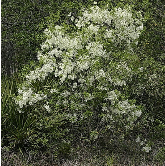
Photo by Shirley Denton. Photograph belongs to the photographer who allows use for FNPS purposes only. Please contact the photographer for all other uses.