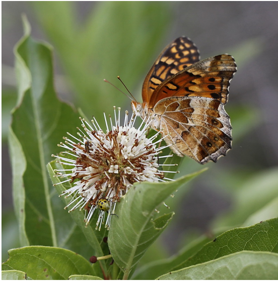
Photo by Shirley Denton. Photograph belongs to the photographer who allows use for FNPS purposes only. Please contact the photographer for all other uses.