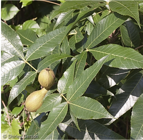
© Shirley Denton Photo by Shirley Denton. Photograph belongs to the photographer who allows use for FNPS purposes only. Please contact the photographer for all other uses.