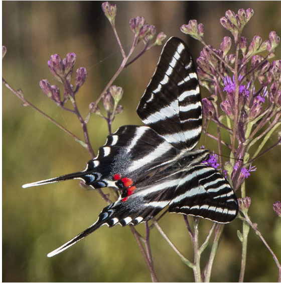
Photo by John Lampkin. Photograph belongs to the photographer who allows use for FNPS purposes only. Please contact the photographer for all other uses.