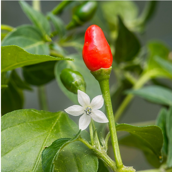
Photo by Roger Hammer. Photograph belongs to the photographer who allows use for FNPS purposes only. Please contact the photographer for all other uses.