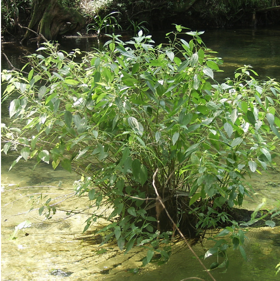
Photo by Shirley Denton, Suncoast Chapter FNPS. Photograph belongs to the photographer who allows use for FNPS purposes only. Please contact the photographer for all other uses.