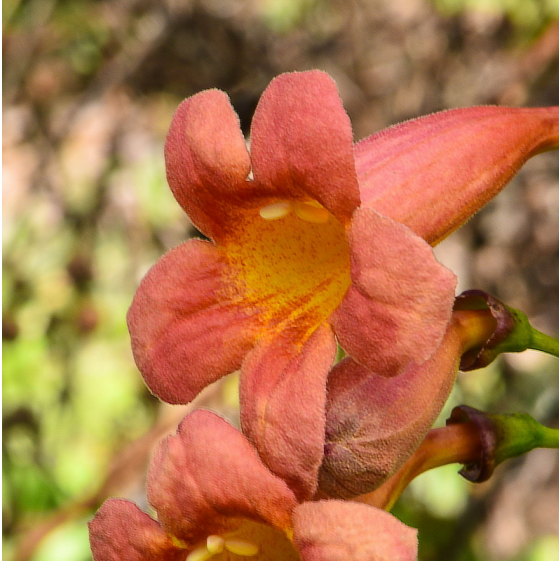
Photo by Roger Hammer, Dade Chapter FNPS. Photograph belongs to the photographer who allows use for FNPS purposes only. Please contact the photographer for all other uses.