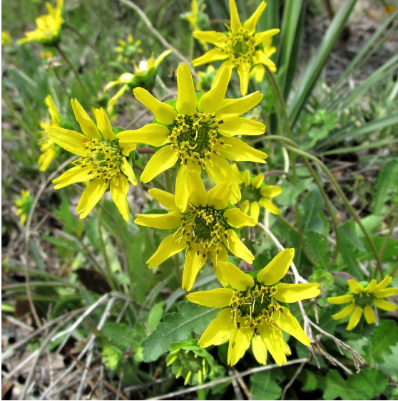
Photo by Ginny Stibolt, Ixia Chapter FNPS. Photograph belongs to the photographer who allows use for FNPS purposes only. Please contact the photographer for all other uses.