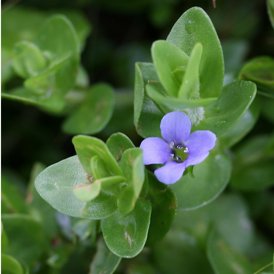
Photo by Shirley Denton. Photograph belongs to the photographer who allows use for FNPS purposes only. Please contact the photographer for all other uses.