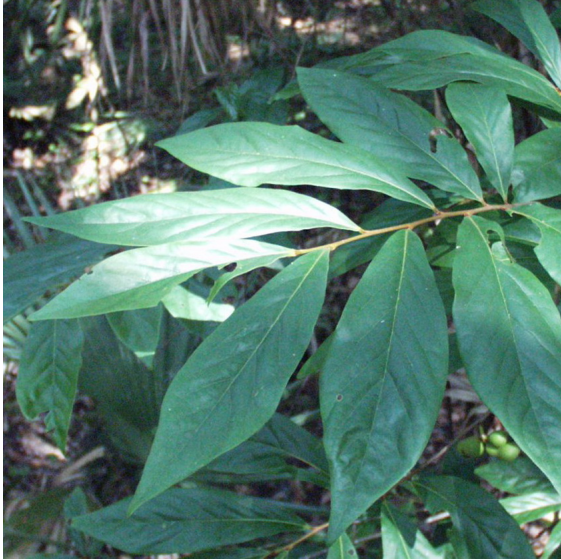
Photo by Shirley Denton. Photograph belongs to the photographer who allows use for FNPS purposes only. Please contact the photographer for all other uses.