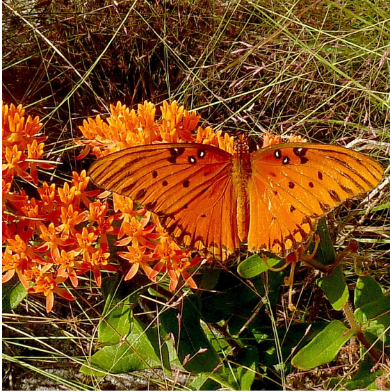
Photo by Eleanor Dietrich. Photograph belongs to the photographer who allows use for FNPS purposes only. Please contact the photographer for all other uses.