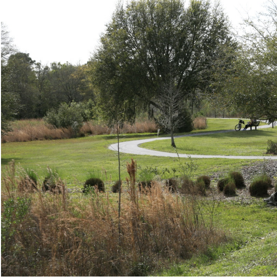
Photo by Shirley Denton. Photograph belongs to the photographer who allows use for FNPS purposes only. Please contact the photographer for all other uses.